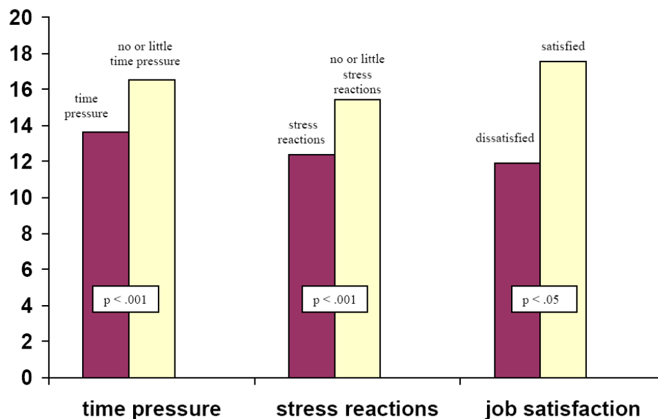
Figure 4. Relationship between time pressure, stress reactions, job satisfaction and Malignant Social Psychology (MSP)