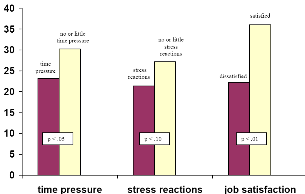
Figure 6. Relationship between time pressure, stress reactions, job satisfaction and smiling (frequency)