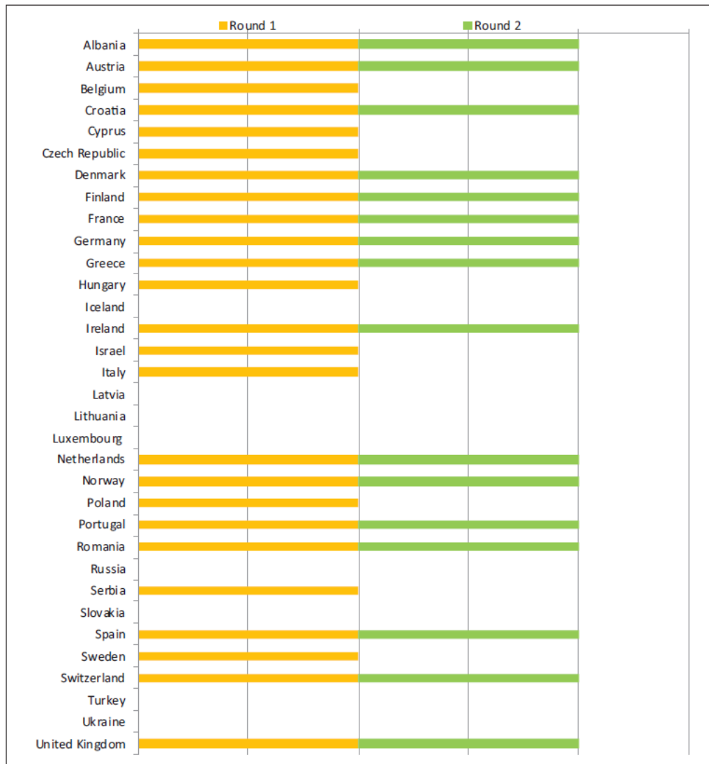
Figure 1 Participating European countries affiliated to the EAPC as associated members in round 1 (online survey in 2016) and round 2 (validation and update in 2018–2019).